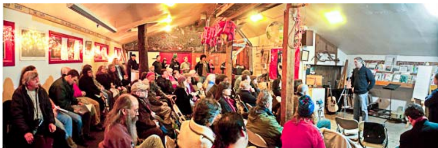
A hearty crowd on New Year's Day at Beacon Sloop Club